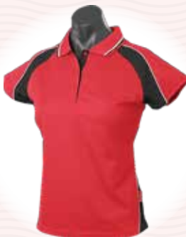
Panorama Polo (14 Colour combinations)