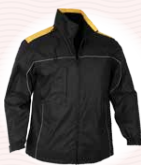
Reactor Jacket (5 Colour combinations)