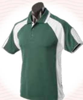
Murray Polo (14 Colour combinations)

Your people are your greatest asset at an event so make sure they present well. We have a large range of polos and business shirts that can be printed or embroidered with your brand or logo to keep your staff looking sharp and distinguishable. Attending a winter event? Jackets and hoodies will be a sought after item.