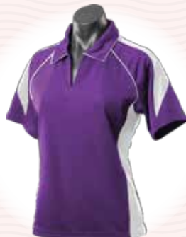
Premier Polo (17 Colour combinations)