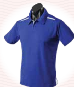
Paterson Polo (21 Colour combinations)