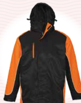
Nitro Jacket (10 Colour combinations)