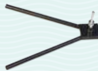
Nova base (11 Color options)