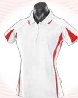
Eureka Polo (25 Colour combinations)