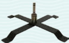
Fold base with water bag