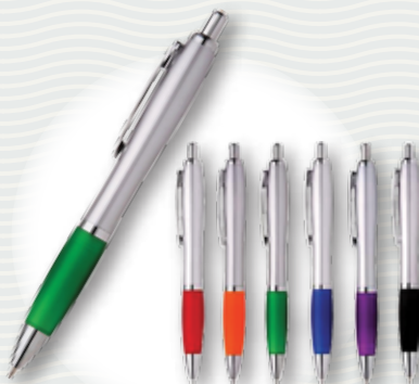
(P48 new york)