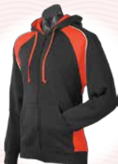
Panorama Hoody (14 Colour combinations)