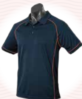
Endeavour Polo (19 Colour combinations)